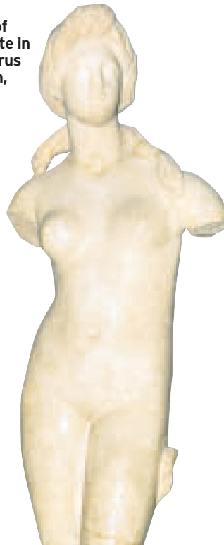
Marble statue of Aphrodite in the Cyprus Museum, Nicosia

From £1,187pp, including flights. (020 8758 4722; www.sunvil.co.uk )