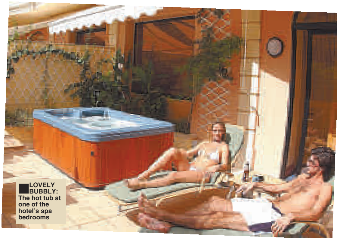
LOVELY BUBBLY: The hot tub at one of the hotel’s spa bedrooms

So if you want days of pampering followed by nights of partying, with a large dose of culture thrown in, make your way to Malta .