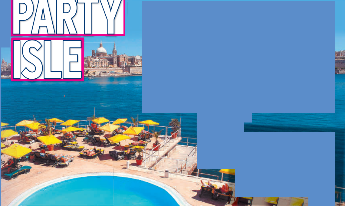
HARBOUR VIEW: From the pool at the Hotel Fortina Resort and Spa you can look across at Valletta. Inset left, the island is now a paradise for clubbers