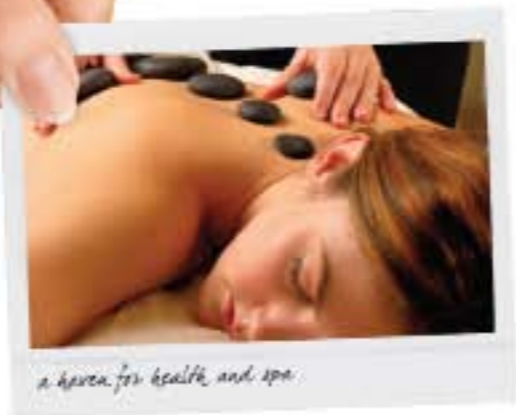
a haven for health and spa