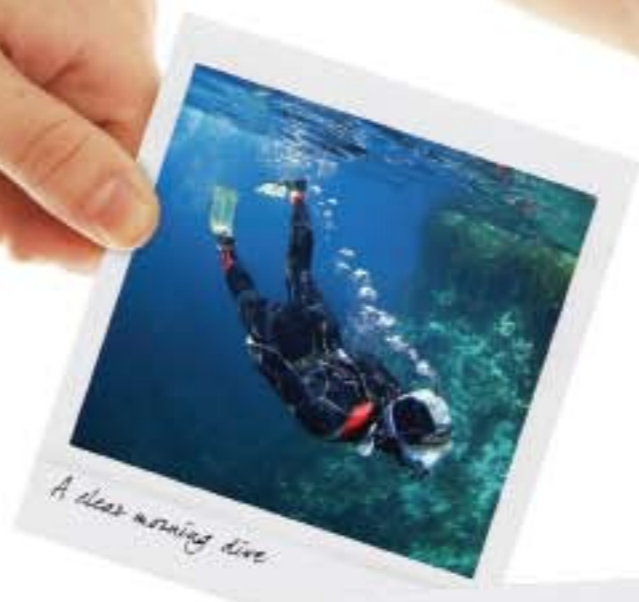
A clear morning dive