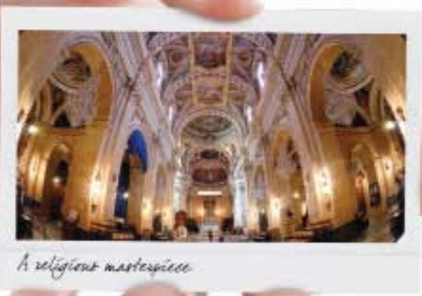
A religious masterpiece