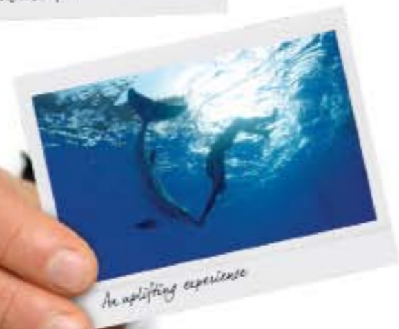
An uplifting experience