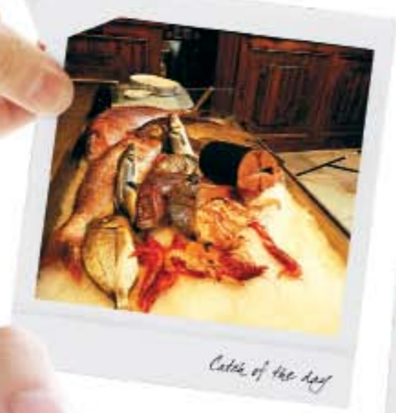
Catch of the day