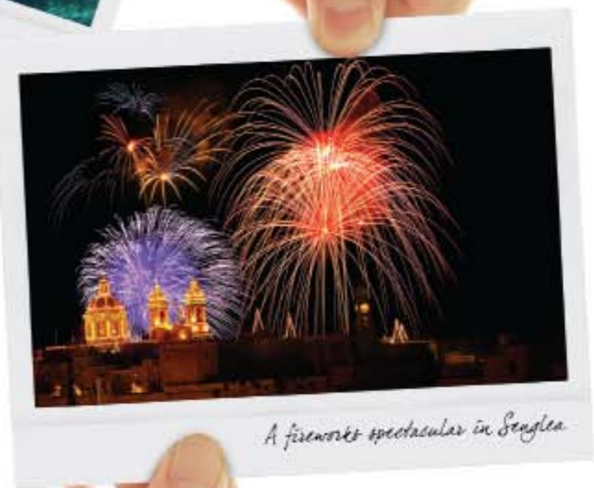
A fireworks spectacular in Senglea