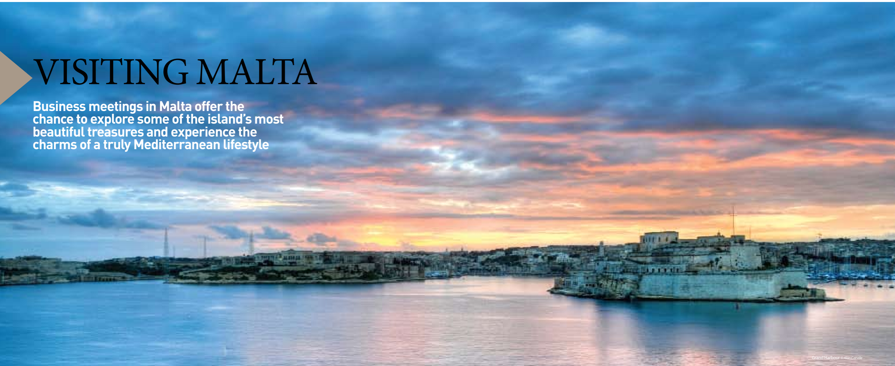
Grand Harbour

Business meetings in Malta offer the chance to explore some of the island's most beautiful treasures and experience the charms of a truly Mediterranean lifestyle