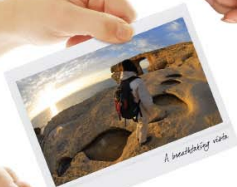
A breathtaking vista