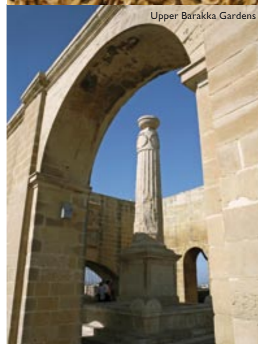
Upper Barakka Gardens