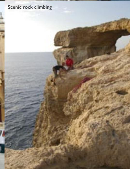
Scenic rock climbing