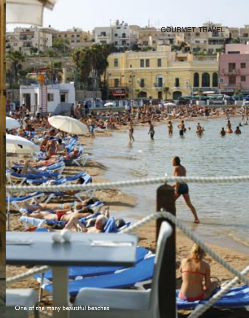
One of the many beautiful beaches