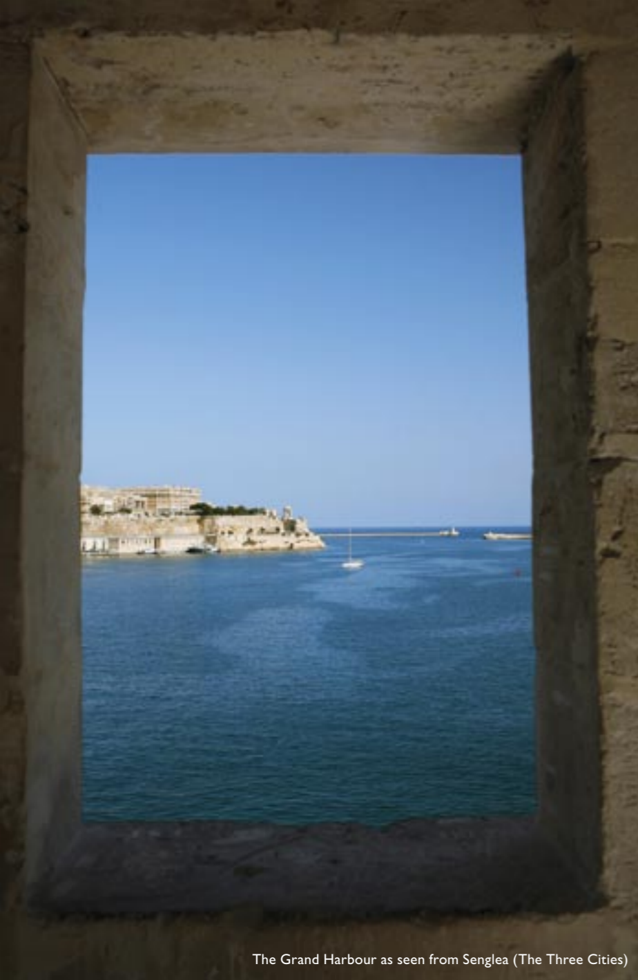
The Grand Harbour as seen from Senglea (The Three Cities)