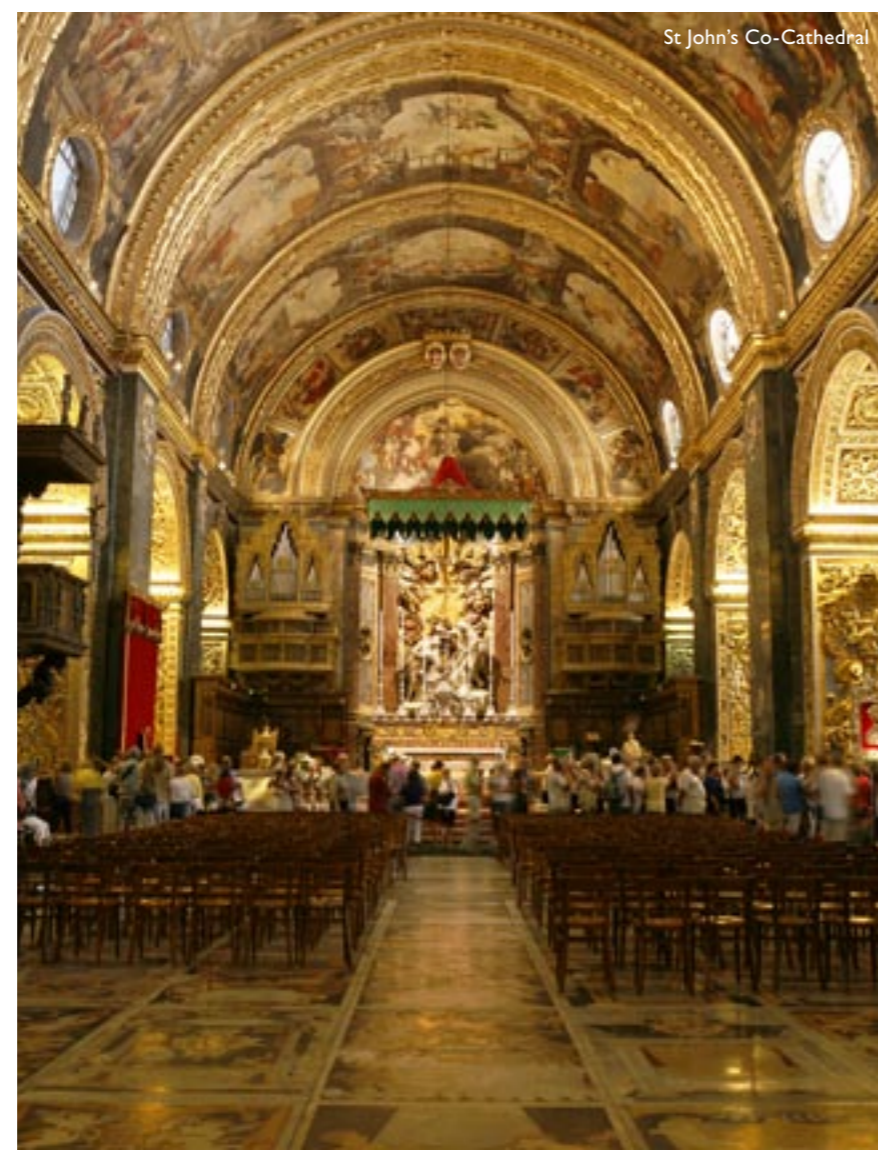
St John’s Co-Cathedral

Among the city’s many highlights is St John’s Co-Cathedral , which was constructed between 1573 and 1577. Its simple, sober façade gives no hint of its lavish interior – inside it is a magnificent decorative masterpiece. Small chapels off the main nave are dedicated to each language group among the knights, and the floor of the church consists of tombs of these soldier/monks, laid out in coloured marble. A personal highlight was seeing up close the most famous of all Caravaggio’s paintings, The Beheading of St. John , which hangs in a private room in the cathedral.