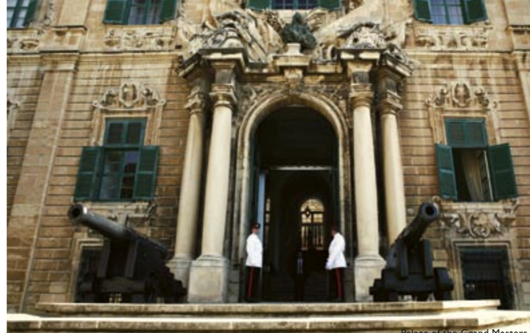
Palace of the Grand Masters

The Upper Barakka Gardens , once the private garden of the knights, offers spectacular views over the Grand Harbour; the biggest and busiest in Malta. Across the water you get a view of the Three Cities. The perfect picture-taking spot.