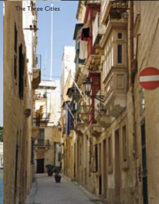
The Three Cities