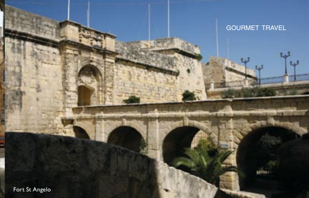
Fort St Angelo