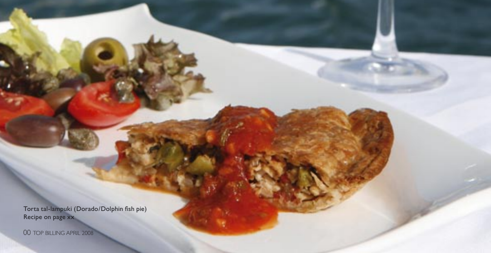
Torta tal-lampuki (Dorado/Dolphin fish pie) Recipe on page xx

We spend a lazy afternoon with one of the owner of Ta'Mena Estate, enjoying this delicious lampuki pie. The sauce is prepared with their delicious sundried tomato paste, made according to their late mother's recipe. She always had a dream turning her small farm into an agro-tourism destination, something her two sons' achieved after her death. They honoured her inspiration by putting her picture on their label.