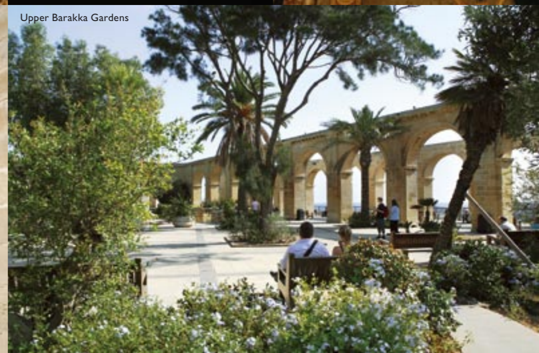
Upper Barakka Gardens