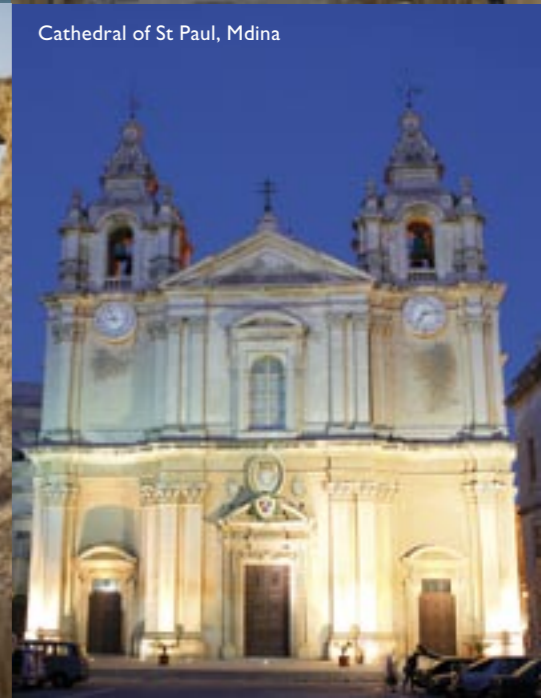
Cathedral of St Paul, Mdina