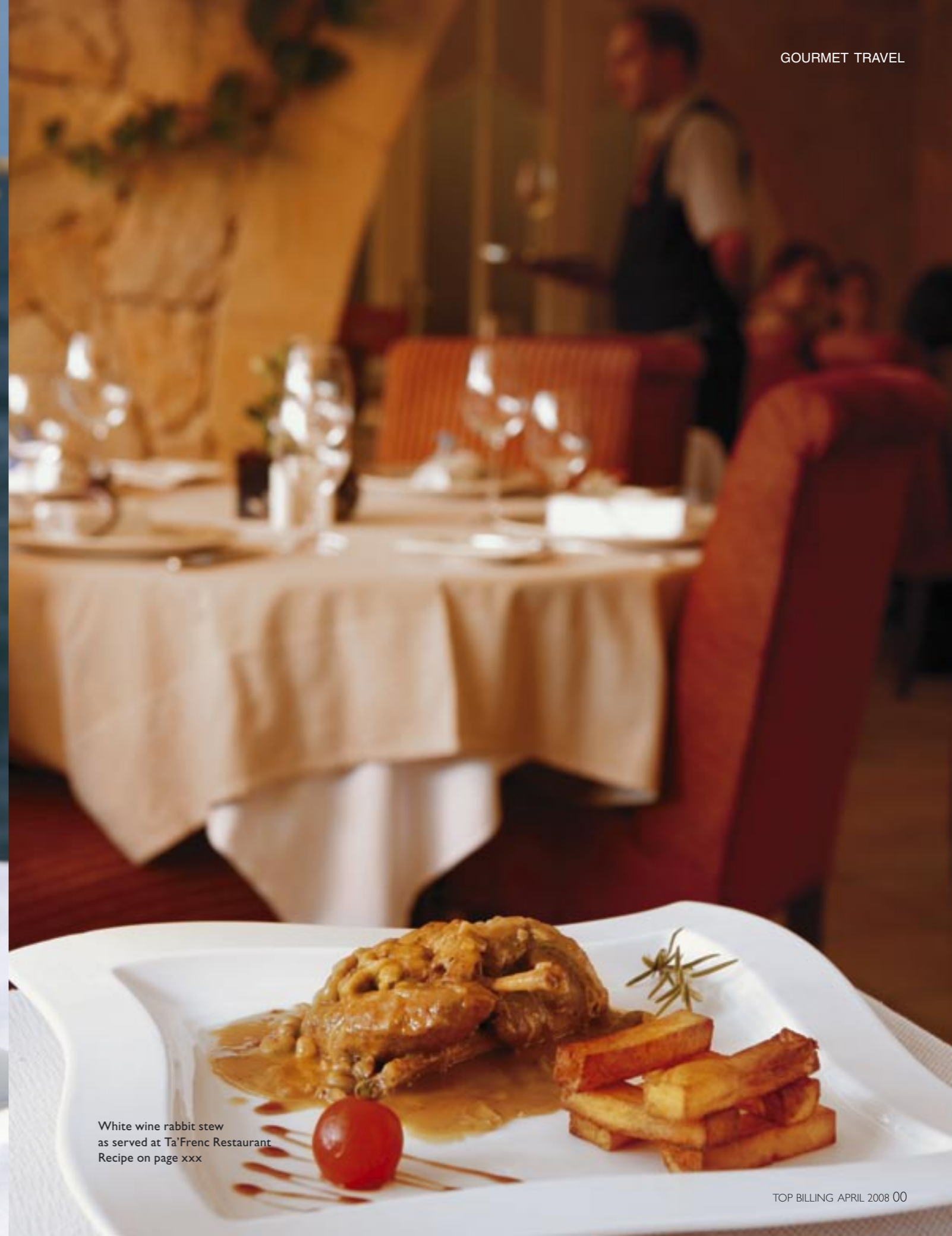
White wine rabbit stew as served at Ta'Frenc Restaurant Recipe on page xxx