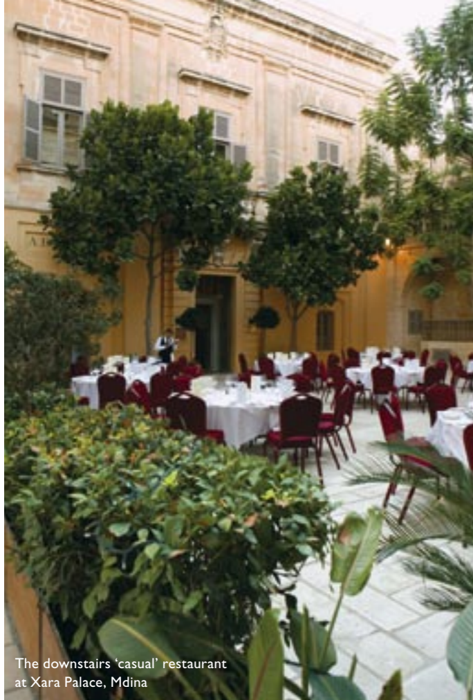
The downstairs 'casual' restaurant at Xara Palace, Mdina