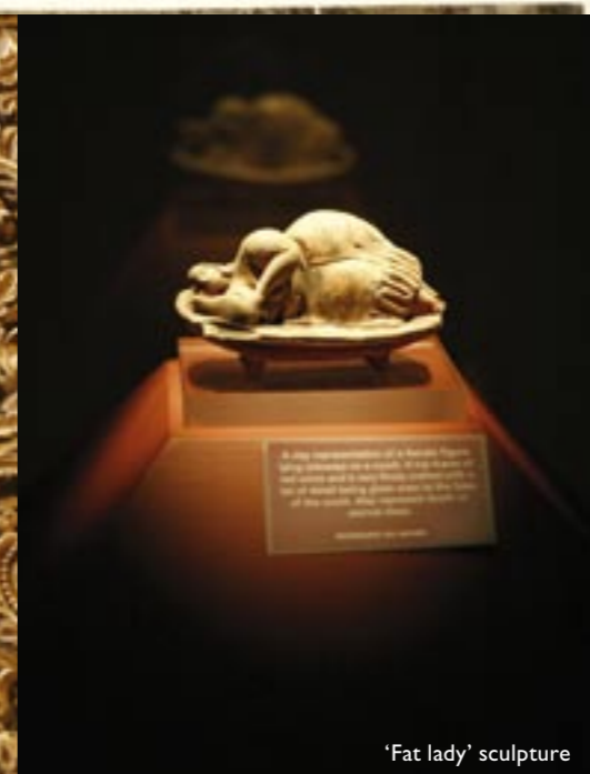
‘Fat lady’ sculpture