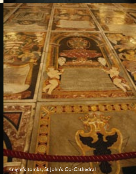
Knight’s tombs, St John’s Co-Cathedral