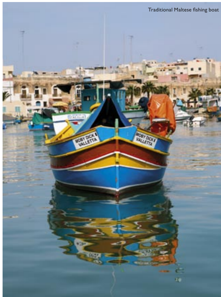
Traditional Maltese fishing boat

Of late Malta has become known as a beach-holiday destination, and its 300-yearly sunny days and warm water certainly justify such marketing. But what makes Malta truly unique is that so much of its intriguing past is visible today – from 500-year-old temples to immense 16th-century fortifications built by the Knights of St John. Couple the history, beaches and moderate climate with friendly locals, good restaurants, scenic landscapes and first-class diving opportunities; and you've got a pocket-rocket destination offering drawcards out of all proportion to its size.