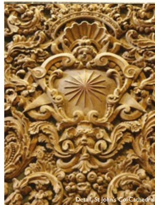
Detail, St John’s Co-Cathedral