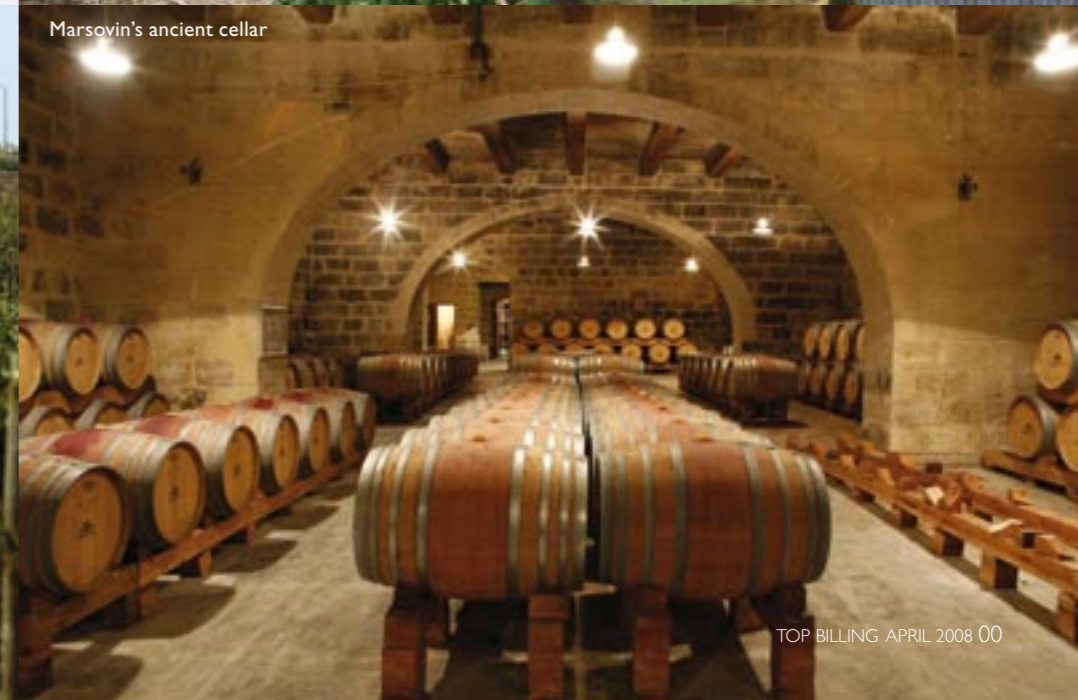
Marsovin's ancient cellar