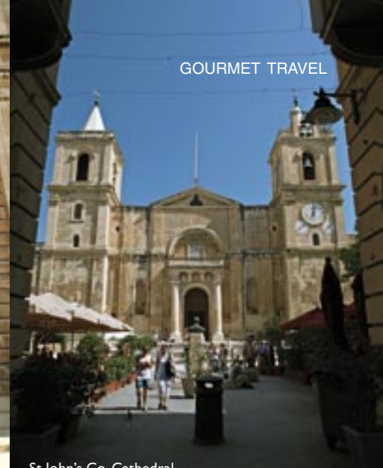
St John’s Co-Cathedral