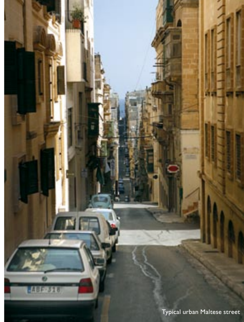
Typical urban Maltese street