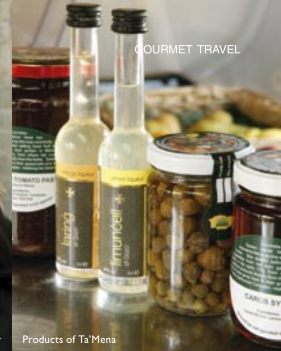
Products of Ta'Mena