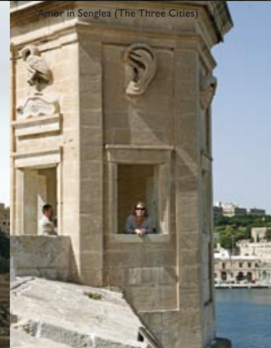
Amor in Senglea (The Three Cities)